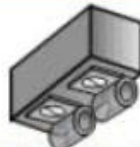
AGC Fuse Breakers