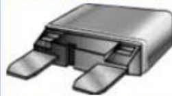
MAXI Fuse Breakers