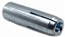
106-6306 3/8 DROP-IN W/INT PLUG