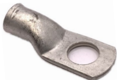
737-0158 1/0 AWG 1/2 HOLE TIN PLATED COPPER LUG