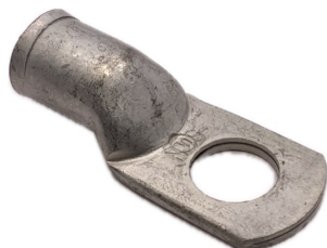
737-0168 2/0 AWG 1/2 HOLE TIN PLATED COPPER LUG