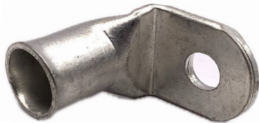
737-0275 3/0 AWG 5/16 HOLE RIGHT ANGLE LUG TIN PLATED