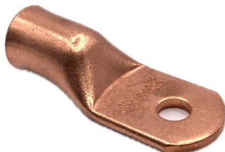
737-0085 4/0 AWG 5/16 HOLE COPPER LUG