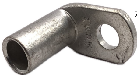
737-0288 4/0 AWG 1/2 HOLE RIGHT ANGLE LUG TIN PLATED