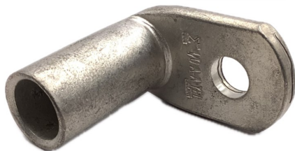
737-0286 4/0 AWG 3/8 HOLE RIGHT ANGLE LUG TIN PLATED