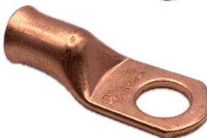
737-0068 2/0 AWG 1/2 HOLE COPPER LUG