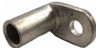
737-0276 3/0 AWG 3/8 HOLE RIGHT ANGLE LUG TIN PLATED