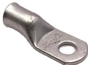
737-0166 2/0 AWG 3/8 HOLE TIN PLATED COPPER LUG