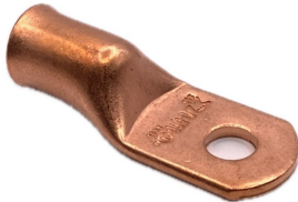
737-0065 2/0 AWG 5/16 HOLE COPPER LUG