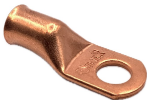
737-0078 3/0 AWG 1/2 HOLE COPPER LUG