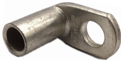
737-0268 2/0 AWG 1/2 HOLE RIGHT ANGLE LUG TIN PLATED