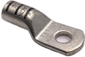
737-0356 1/0 AWG 3/8 HOLE HEAVY DUTY COPPER LUG TIN PLATED