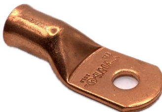
737-0075 3/0 AWG 5/16 HOLE COPPER LUG