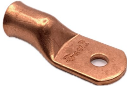
737-0064 2/0 AWG 1/4 HOLE COPPER LUG