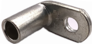
737-0266 2/0 AWG 3/8 HOLE RIGHT ANGLE LUG TIN PLATED