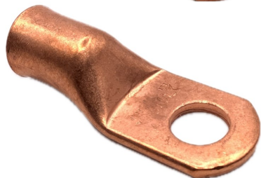
737-0088 4/0 AWG 1/2 HOLE COPPER LUG