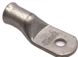
737-0164 2/0 AWG 1/4 HOLE TIN PLATED COPPER LUG