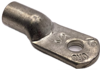
737-0365 2/0 AWG 5/16 HOLE HEAVY DUTY COPPER LUG TIN PLATED