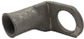
737-0258 1/0 AWG 1/2 HOLE RIGHT ANGLE LUG TIN PLATED