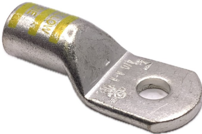
737-0386 4/0 AWG 3/8 HOLE HEAVY DUTY COPPER LUG TIN PLATED