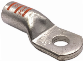
737-0366 2/0 AWG 3/8 HOLE HEAVY DUTY COPPER LUG TIN PLATED