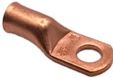
737-0056 1/0 AWG 3/8 HOLE COPPER LUG