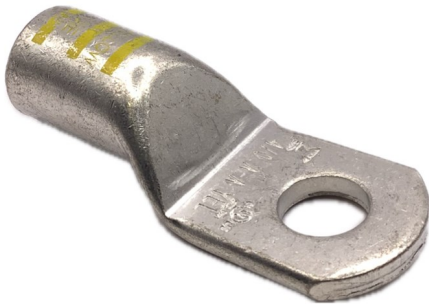
737-0388 4/0 AWG 1/2 HOLE HEAVY DUTY COPPER LUG TIN PLATED