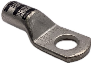
737-0358 1/0 AWG 1/2 HOLE HEAVY DUTY COPPER LUG TIN PLATED