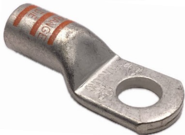
737-0368 2/0 AWG 1/2 HOLE HEAVY DUTY COPPER LUG TIN PLATED