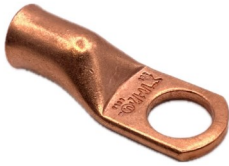
737-0058 1/0 AWG 1/2 HOLE COPPER LUG