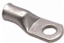
737-0156 1/0 AWG 3/8 HOLE TIN PLATED COPPER LUG