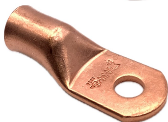
737-0086 4/0 AWG 3/8 HOLE COPPER LUG