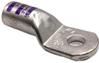
737-0376 3/0 AWG 3/8 HOLE HEAVY DUTY COPPER LUG TIN PLATED