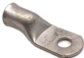
737-0165 2/0 AWG 5/16 HOLE TIN PLATED COPPER LUG