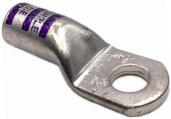
737-0378 3/0 AWG 1/2 HOLE HEAVY DUTY COPPER LUG TIN PLATED