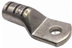
737-0355 1/0 AWG 5/16 HOLE HEAVY DUTY COPPER LUG TIN PLATED