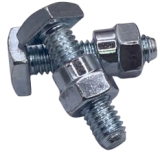
853-9020 BATTERY NUTS & BOLTS