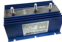
854-0504 130 AMP BATTERY ISOLATOR