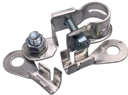
853-2014 1-4 AWG UNIV. OEM TERM.