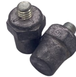
853-9015 SIDE MOUNT NEG. CHARGING POST