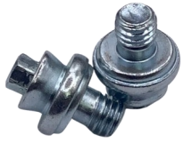
853-7800 SIDE MOUNT BATTERY BOLT