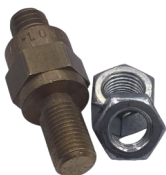
853-9004 LONG SIDE MOUNT BATTERY BOLT