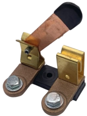
854-0188 DISCONNECT SWITCH EYE TO EYE