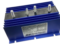
854-0502 120 AMP BATTERY ISOLATOR