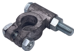
853-2002 UNIV. BOLT TYPE POS.