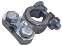
853-2001 TOP POST UNIV. TERMINAL