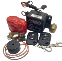
854-0395 AUTO BATTERY DISCONNECT SWITCH