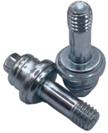
853-7803 3/8X1" EXTENDED SIDE MOUNT BATTERY BOLT