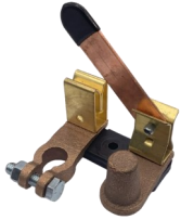
854-0138 DISCONNECT SWITCH TOP POST