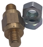
853-9003 UNIVERSAL SIDE MOUNT BATTERY BOLT