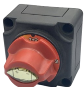
854-0387 MINI DISCONNECT SWITCH 2 POSITION