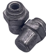
853-9011 SIDE MOUNT POS. CHARGING POST