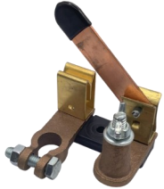
854-0148 DISCONNECT SWITCH W/ STUD WING NUT