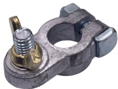
853-2021 3/8" WING NUT MARINE POS.