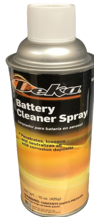
999-2014 BATTERY CLEANER SPRAY