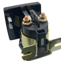
854-0506 200 AMP BATTERY SEPERATOR