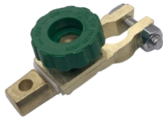
853-2020 QUICK CONNECT TERM.