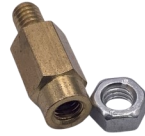
853-9005 TOP MOUNT UNIVERSAL BATTERY BOLT