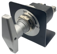
854-0247 DISCONNECT SWITCH W/ LOCKOUT PLATE