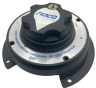
854-0360 MASTER DISCONNECT SWITCH