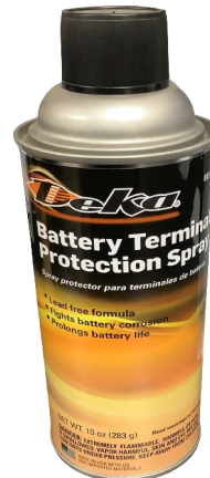
999-2015 BATTERY TERMINAL PROTECTION SPRAY