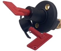
854-0405 DISCONNECT SWITCH KEYED 854-0406 SPARE KEY FOR STOP-K